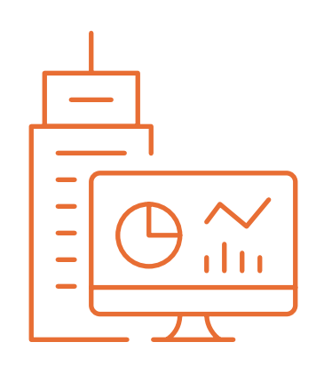
Traditional Property Management Software

CRE TECH SOLUTIONS CAN BE BROKEN DOWN INTO FOUR CATEGORIES: