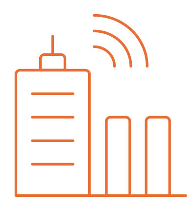
"Smart" Building Software